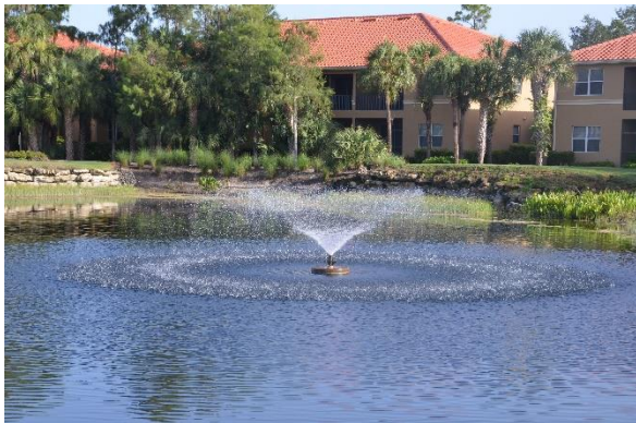
Lake 21 (west)