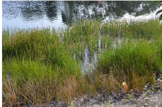
Lake 22 (west into 24)

g. Lake Drainage Pipes: As noted above on lake 21 under lake bank erosion.