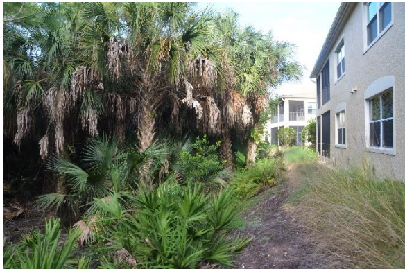
Palms behind buildings

Concerns expressed about potential debris (palm fronds) build up in C3 were expressed last month. Areas appear to be in good shape. Evidence of some trimming by residents or maintenance crews was observed.