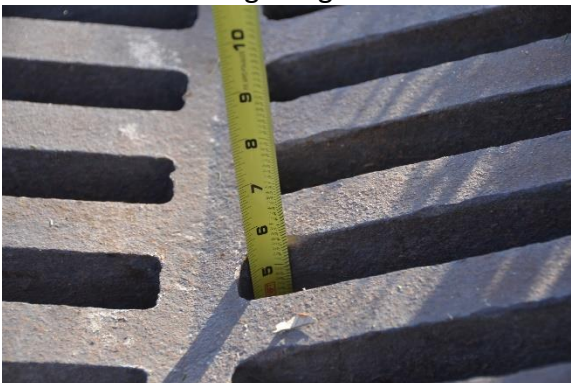
Southeast basin 5 inches to top of debris