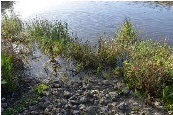
Lake 18 (west into 19)

f. Inter-Connect/Drain Pipes: Partial blockages from littoral growth noted in Lakes 18 and 22 in last report have not yet been cleared. The drains into the north end of Lake 24 was not visible due to turbid water.