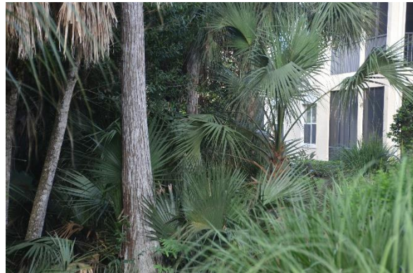
Trimmed Palm at edge of C3