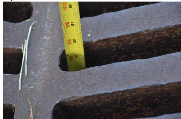
Northwest basin 20 inches to top of debris