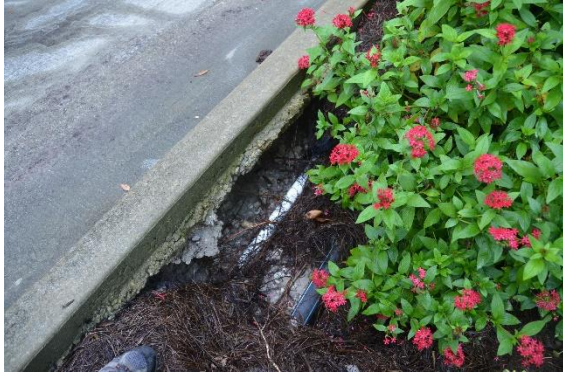
East side of Lake 17

Erosion previously noted by drain next to yellow tees on Lake 21 has become worse. Gully formed is now almost 24 inches deep. Appears to be a broken or blocked drain pipe.