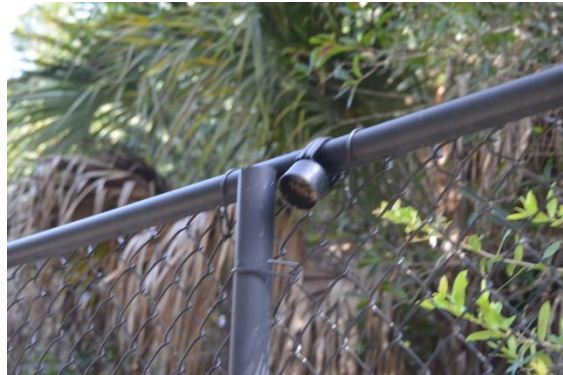
Fence cap separated from pole along north line

Potato vine also noted growing over fence from northern property across the street from 12060 Matera Lane.