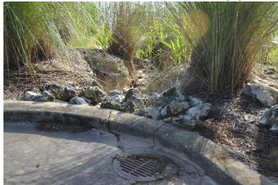
Lake 21 (June 30)