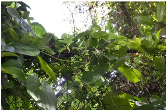
Matera Lane fence with vines growing over

Potato vine also noted growing over fence from northern property across the street from 12060 Matera Lane.