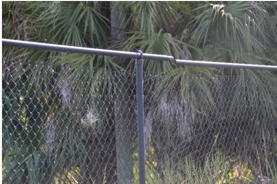
North fence area C5 by FPL area

Fencing along the north side of Conservation area C5 has separated. Top rail separated and fencing has become unattached. Several top caps also noted separating from posts.