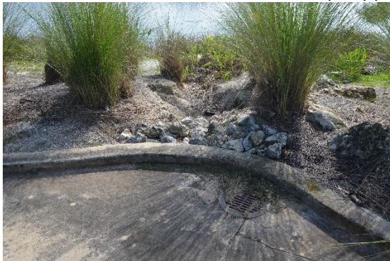
Lake 21 (May 27)

Erosion previously noted by drain next to yellow tees on Lake 21 has become worse. Gully formed is now almost 24 inches deep. Appears to be a broken or blocked drain pipe.