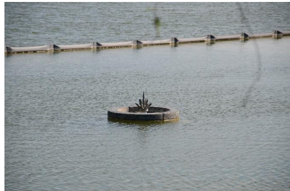
Lake 24 (west)

Diffusers in several Lakes did not appear to be working issues noted in Lake 1 (north), Lake 3 (south central diffuser), Lakes 8 and 9, Lakes 18 and 19, Lake 21, and Lake 25.